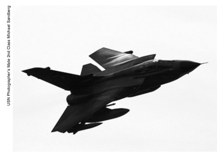
A German Panavia Tornado IDS during the annual maritime exercise Baltic Operations 2003 (BALTOPS).